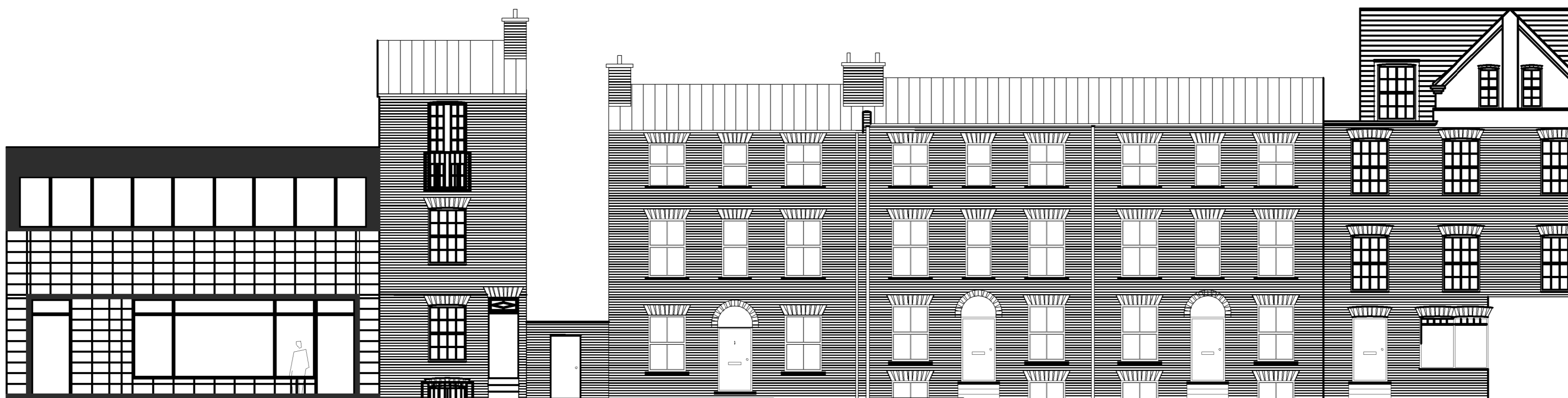
Existing street elevation 1:100

NOTE This drawing is not to be scaled. All dimensions to be checked on site and any discrepancies to be reported. All drawings to be read in conjunction with specification where applicable.